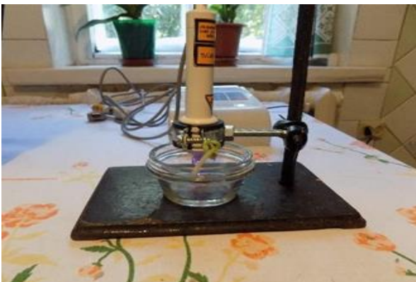
Fig. 1. Image of the process of laser treatment of the root system of beans "Saharnaja"

On each day of the experiment, the values of total salt content per unit volume were monitored, which should be equal to ppm = 300 and the degree of acidity or alkalinity, which should be ph = 6,5 of the nutrient solution. Activation of physiological processes in beans was recorded by the average height and average diameter of the stem. As a result of experimental research the data set on the basis of which the histogram of dependence of average height of a stalk was constructed was received x_{aver.hei.} cm from the day of the experiment and the constant parameters of electromagnetic radiation for the first row of sprouts \lambda_1 = 405 , W_1 = 0,1 , for the second row of sprouts \lambda_2 = 658 and W_2 = 0,4 , control fig. 2, as well as a histogram of the average diameter of the stem x_{aver.diam.} cm from the day of the experiment and the constants given above, fig. 3. Excel 2013 information was used to build charts [3].